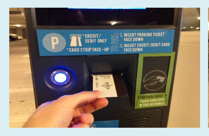
Step 3: Insert the voucher provided to you for exiting.