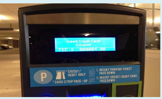
Step 4: Machine will process voucher, raising the gate for exit.